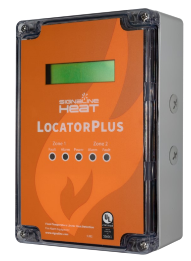
Compatible with the new Signaline LocatorPlus Dual Zone Monitor Module

Signaline FT cable is proudly manufactured in the UK