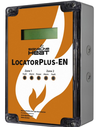
FT-78-EN is to be used with the Signaline LocatorPlus-EN and the Signaline FT-EOL-EN

Tel: +44(0)1252 725257 Email: sales@lgmproducts.com