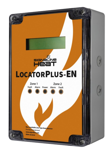
FT-88-EN is to be used with the Signaline LocatorPlus-EN and the Signaline FT-EOL-EN

Tel: +44(0)1252 725257 Email: sales@lgmproducts.com